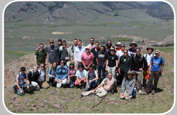
Overall, 2012 was a wonderful year with great weather, spectacular geology, and an enthusiastic group of students.