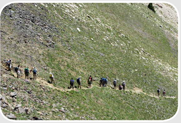
The students descend from Duff's Bench during a day of introduction to the stratigraphy of the Alta area and the mapping of ramps and flats in faulted rocks of the Sevier thrust belt.

Field camp is so much more than a class. I was amazed at the projects we were able to accomplish each week and you and your cohort will share a unique bond created by the whole experience. It was truly the best summer I have had in college.--Nina Bingham, 2012 Field School Participant